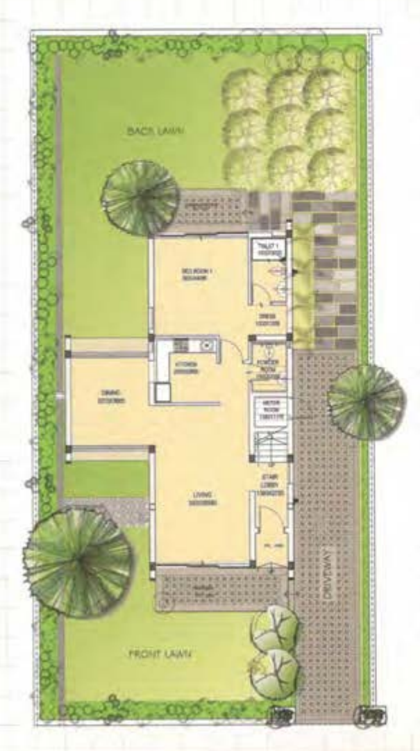
Orchid: Bungalow Plan (Without Servant's Room)