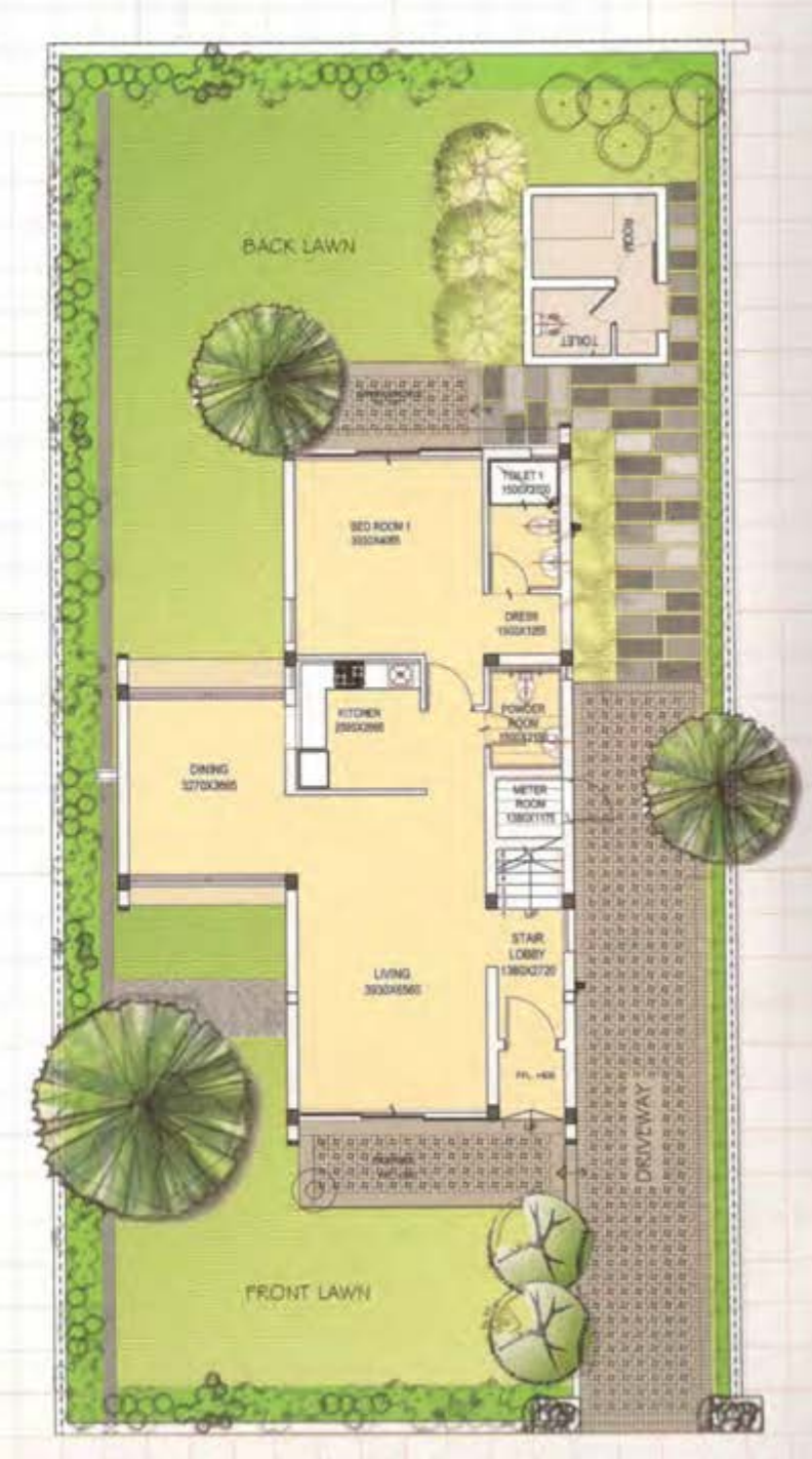
Orchid: Bungalow Plan (With Servant's Room*)