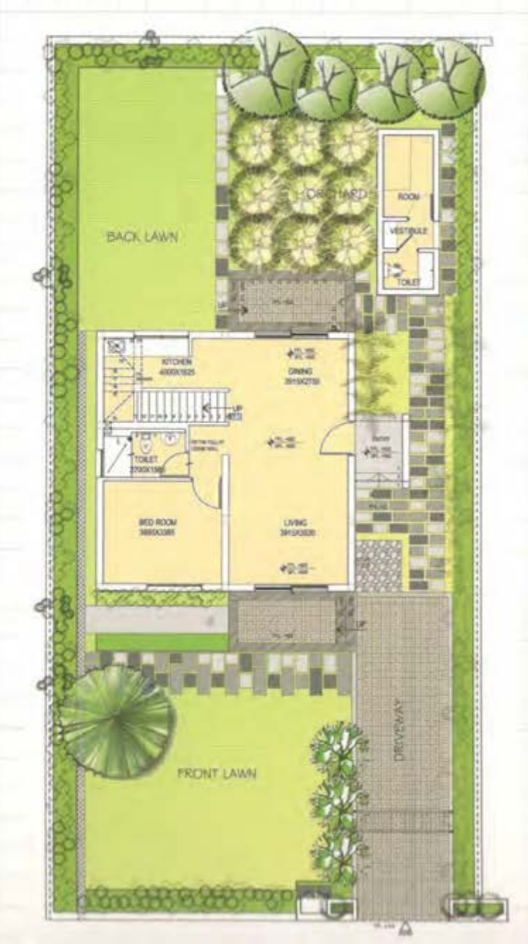
Lavender: Bungalow Plan (Without Servant's Room)